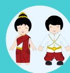
Culture and art