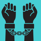
Offenders, prisoners in the jail or the confined place