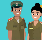
National defense - security teams