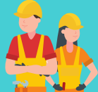
Employer and employee