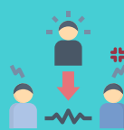
Arbitration and dispute resolution