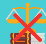
People who are violating law in the village