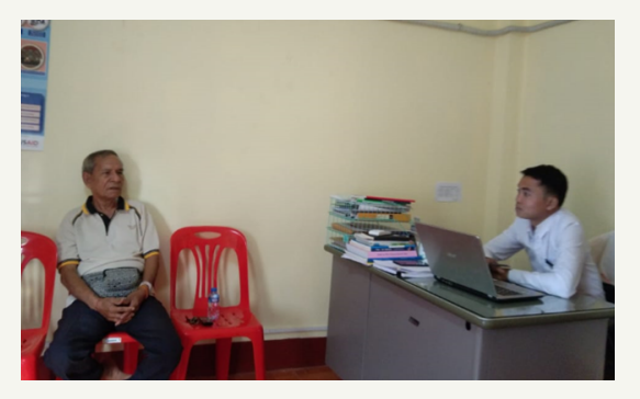
(Remark: This image is simulated consultation)