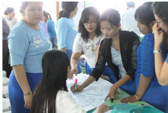
Legal Ethics, Pro Bono, Access to Justice, and Professional Responsibility Curriculum Development Project