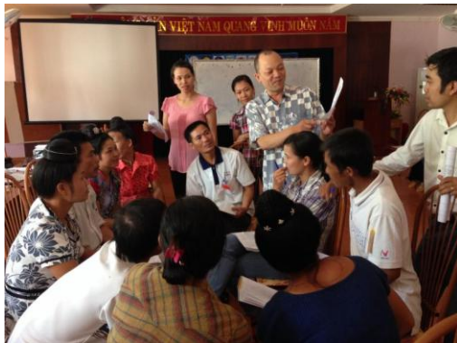
CLE Student initiative: Working, teaching and learning about "HIV and the rights of PLHIV" with HIV+ Vietnamese Community trainers