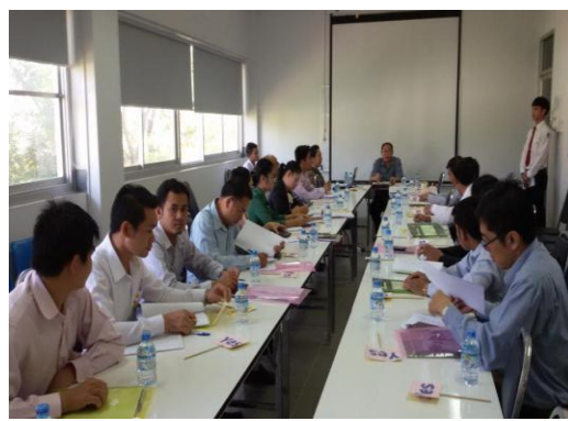
First National CLE Workshop, Introducing CLE Programmes and CLE Methodology,