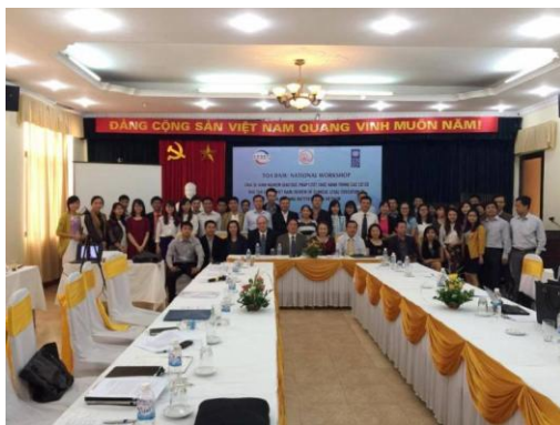
CLE Evaluation Meeting in Vietnam: Looking Back to Move Forward.

BABSEA CLE is part of a consortium that has won a tender from UNDP to develop and deliver training as part of a Rule of Law Pilot Project in Myanmar. The project was initiated by the Parliamentary Rule of Law and Tranquility Committee, and runs from October 2014 to February 2015. The project is also supported by the governments of Australia, UK, Japan and USA. Read more!