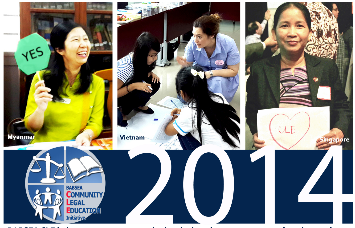
BABSEA CLE helps to support community legal education programmes, educating pro bono champions of tomorrow as they serve the legal needs of marginalized communities today.